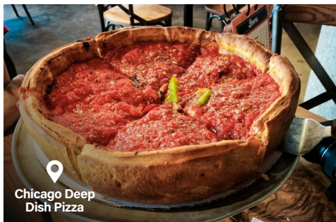
Chicago Deep Dish Pizza