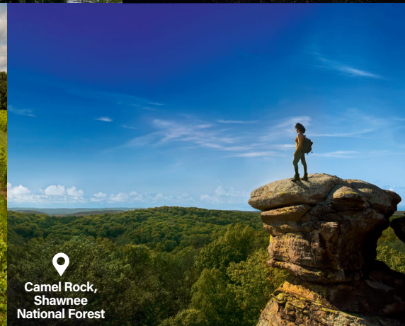
Camel Rock, Shawnee National Forest