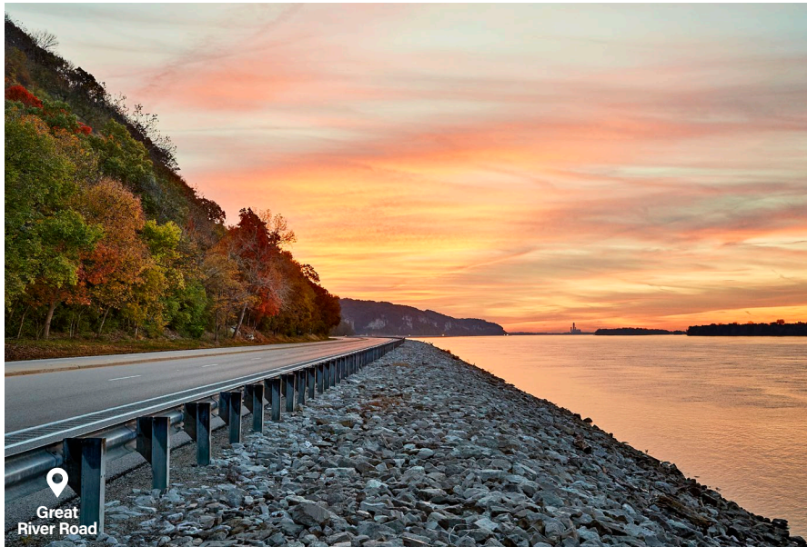
Great River Road