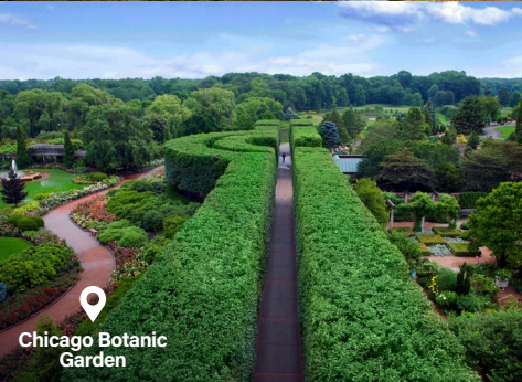
Chicago Botanic Garden