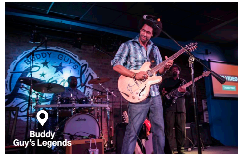
Buddy Guy's Legends