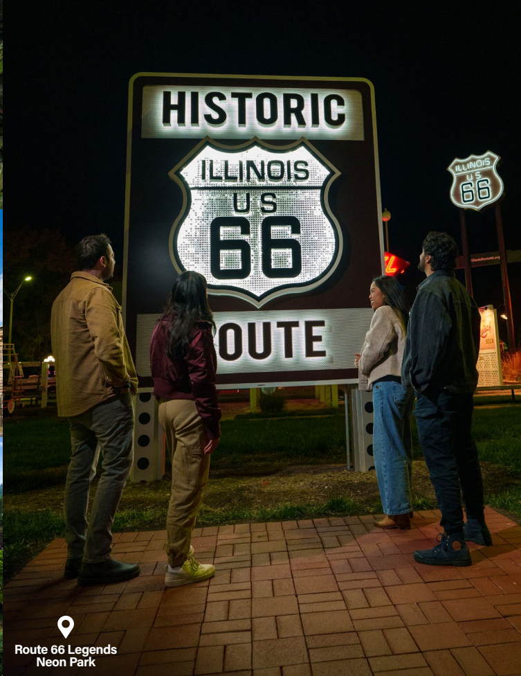
Route 66 Legends Neon Park