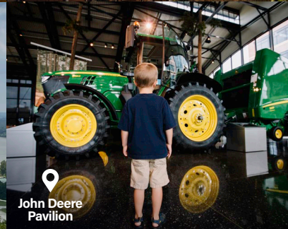
John Deere Pavilion