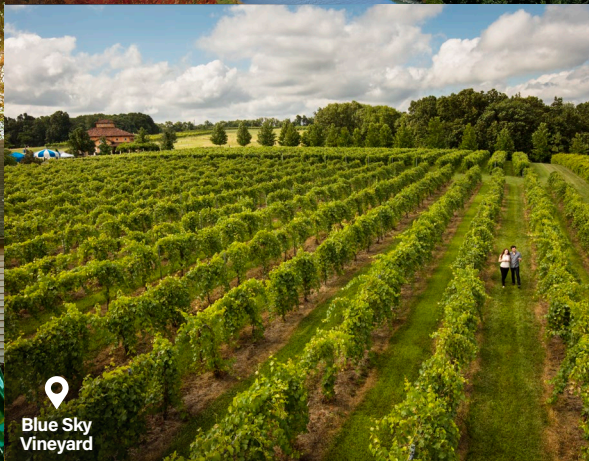
Blue Sky Vineyard