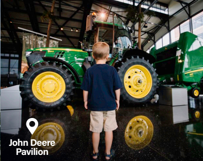
John Deere Pavilion