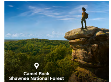
Camel Rock Shawnee National Forest

In Southern Illinois, nestled between the Ohio and Mississippi rivers, Shawnee National Forest features hiking trails through canyons and forest canopies. Enjoy stunning views at Garden of the Gods and experience thrilling activities including rock climbing, zip lining and wildlife photography, as well as a unique glamping experience at Shawnee Hills Glamping .