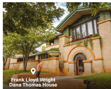
Frank Lloyd Wright Dana Thomas House